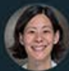
PROF ALDA TAM USA